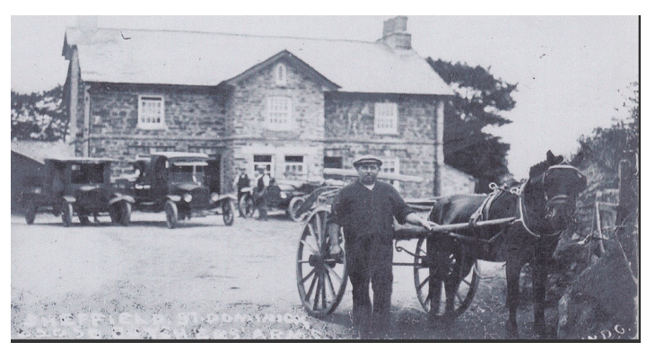
Outside the Butchers Arms now the Who'd Have Thought It Pub

Cotehele House, National Trust property, gardens, cafes, shop and facilities